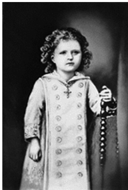
St. Thérèse—age 8

"Jesus is in paradise and it is there your heart should dwell." ~St. Therese of Lisieux